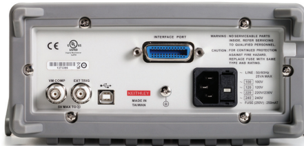
Model 2110 rear panel.

INPUT BIAS CURRENT: <30pA at 25°C. INPUT PROTECTION: 1000V all ranges (2W input). AC CMRR: 70dB (for 1kΩ unbalance LO lead). POWER SUPPLY: 100V/120V/220V/240V. POWER LINE FREQUENCY: 50/60Hz auto detected. POWER CONSUMPTION: 25VA max. DIGITAL I/O INTERFACE: USB-compatible Type B connection, GPIB (option). ENVIRONMENT: For indoor use only. OPERATING TEMPERATURE: 0° to 40°C. OPERATING HUMIDITY: Maximum relative humidity 80% for temperature up to 31°C. STORAGE TEMPERATURE: –40° to 70°C. OPERATING ALTITUDE UP TO 2000 M ABOVE SEA LEVEL. BENCH DIMENSIONS (WITH HANDLES AND BUMPERS): 107 mm high × 252.8 mm wide × 305 mm deep (3.49 in. × 9.95 in. × 12.00 in.). WEIGHT: 2.23 kg (4.92 lbs.). SAFETY: Conforms to European Union Low Voltage Directive, EN61010-1. Measurement Cat I 1000V and CAT II 600V. EMC: Conforms to European Union Directive 89/336/EEC, EN61326-1. WARRANTY: Three years.