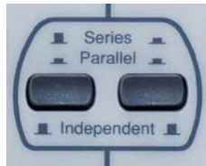
Internal connection for tracking Series and Parallel operation via control panel

In addition to independent output channels, the GPE-X323 series provides tracking series and parallel operation (For GPE-2323/GPE-3323/GPE-4323). The series and parallel connections allow power supplies to output 32V/6A (Parallel Connection) and 64V/3A (Series Connection).