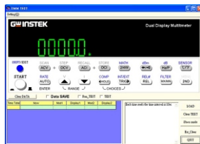
General Control Mode