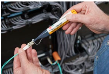
What's the polarity?