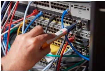
Is this SFP working?