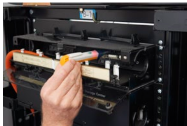
Is this port in use?