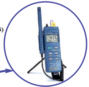
Tripod Mountable (tripod not included)